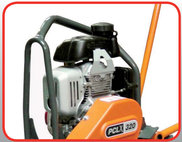
Tubular Protective Frame