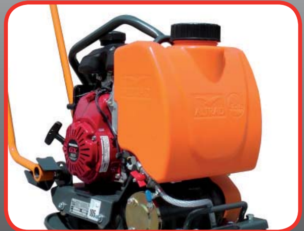
12ltr Quick-Release Water Tank